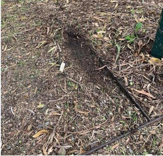
Rake all these chips back into the playground bed