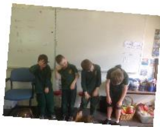
lèi 累 (tired)