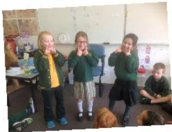
kāixīn 开心 (happy)

In LOTE lessons, Year 1 and Year 2 students are learning words about how to express their feelings. They were acting the words of what the teacher said.