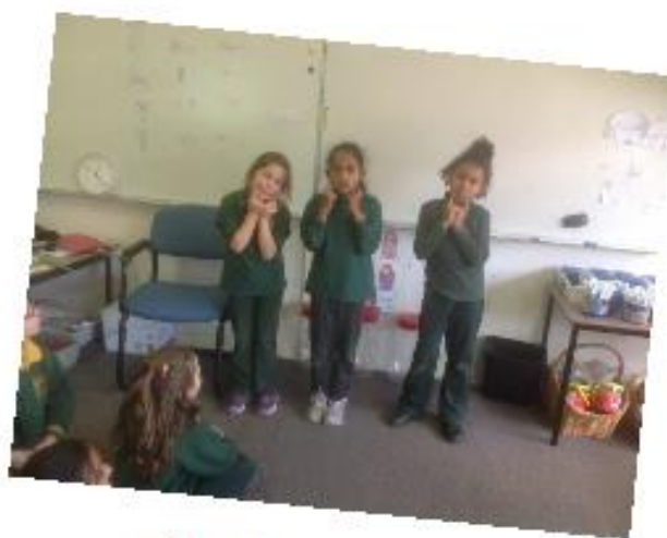
shāngxīn 伤心 (sad)