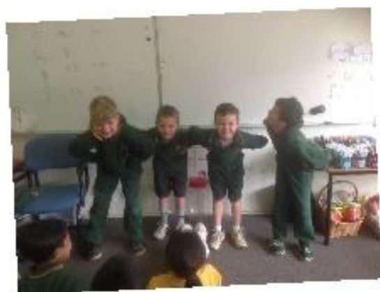
shēngqì 生气 (angry)