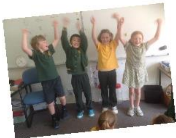
xīngfèn 兴奋 (excited)